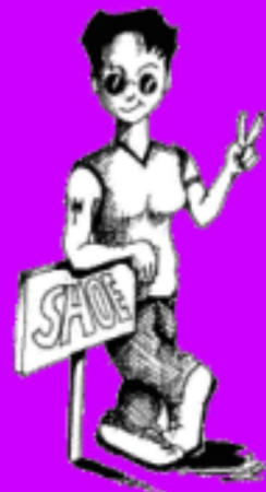
SHOE INTERNATIONAL